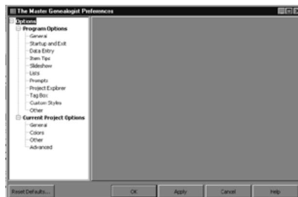
Figure 4-2: Preferences

There are two main sections to Preferences: Program Options and Current Project Options .